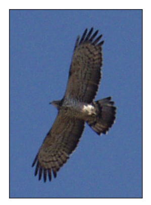
Plate I. Crested Honey Buzzard Pernis ptilorhyncus, Chimgan, Uzbekistan, May 9 2006.

Our recent observations of Crested Honey Buzzard in Uzbekistan have led us to review its status in Central Asian (Middle Asian) countries other than Kazakhstan (Plate 1). Only few published records of Crested Honey Buzzard in these other countries exist, mainly in the Russian literature and solely in Uzbekistan and Tajikistan. Table 1 shows these published records together with the recent observations from Uzbekistan. There are 13 records from Uzbekistan and three from Tajikistan,