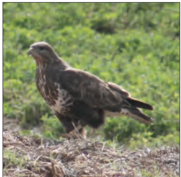
Plate 1. (left) Nominat Common Buzzard Buteo b. buteo Madaba, Jordan, 15 January 2016.