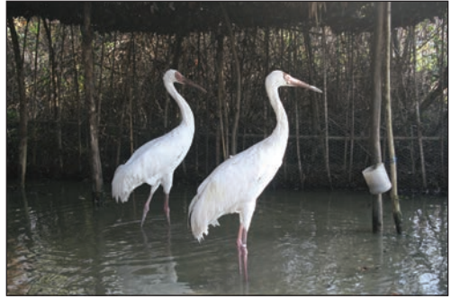
Plate 4. Inya and Vitim in captivity at Fereydoon Kenar damgah the day before Inya's release, 28 January 2007.