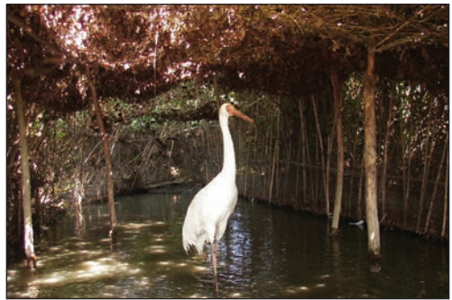
Plate 6. Vitim in captivity at Fereydoon Kenar damgah, summer 2007.

plastic band on the left leg. Suna was ringed with a green plastic band (white number 03 and attached PTT #33244) on the right leg and a standard metal ring (A185986) on the left leg. On 3 March 2004, they commenced migration. However, Suna was caught by local people c300 km away near Anzali wetland in Gilan province, and taken into captivity at Bujagh national park until autumn 2005 (Markin & Sadeghi Zadeگان 2003b). The plastic band and PTT were removed from her.