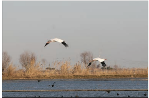
Plate 10. Vitim and wild Siberian Crane, Fereydoon Kenar damgah, 5 February 2008.