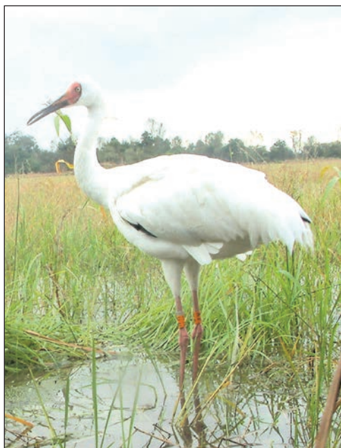
Plate 2. Suna just after release at Fereydoon Kenar damgah, 7 November 2005.

Winter 2003/04. Two young Siberian Cranes, 'Vokhma', a male, and 'Suna', a female, parent-reared at OCBC, were released at Fereydoon Kenar damgah, on 26 and 27 December 2003 respectively. Vokhma was ringed with a standard metal ring (A145985) on the right leg and a blue-white-yellow