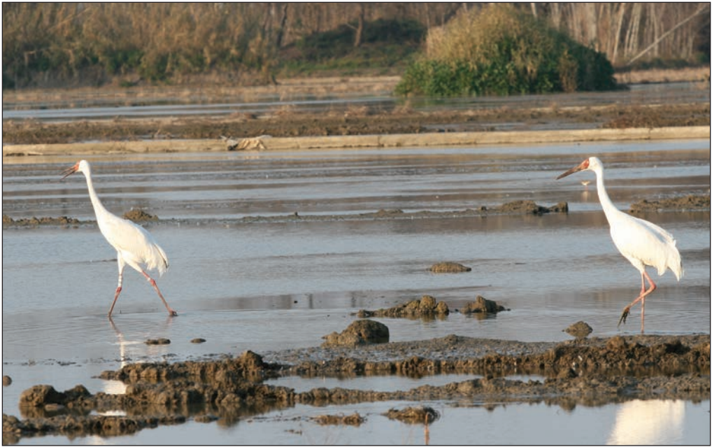
Plate 15. Neya and wild Siberian Crane, Fereydoon Kenar damgah, 22 January 2009.

migration on 23 February (they were not observed in the area by local people after that date).