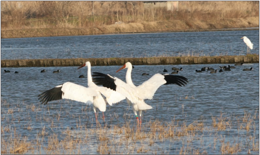
Plate 12. Vitim and wild Siberian Crane, Fereydoon Kenar damgah, 5 February 2008.