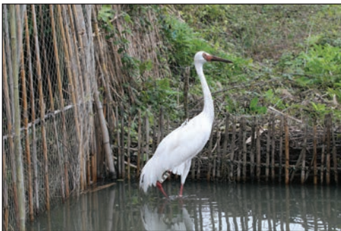
Plate 13. Neya in pen at Fereydoon Kenar damgah, 10 December 2008.