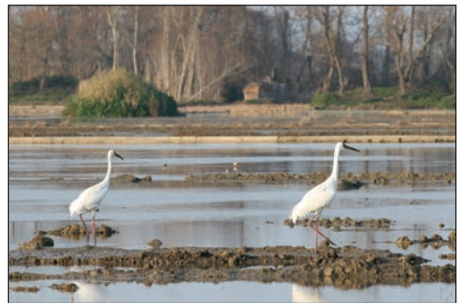
Plate 14. Neya and wild Siberian Crane, Fereydoon Kenar damgah, 22 January 2009.

kept together and started migration on 28 February. Unfortunately, no satellite transmitter data was received after her departure.