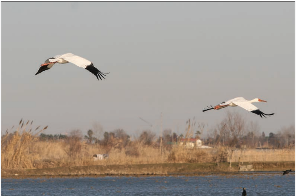
Plate 11. Vitim and wild Siberian Crane, Fereydoon Kenar damgah, 5 February 2008.