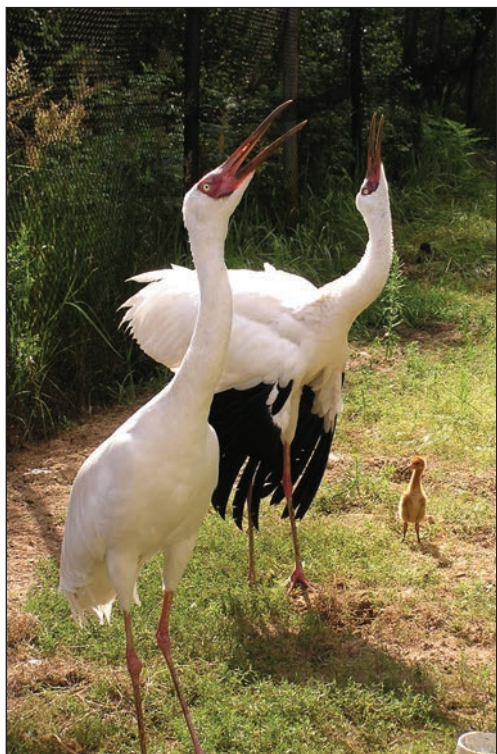
Plate 1. Parent-reared Siberian Crane Grus leucogeranus chick, Oka Crane Breeding Centre, Russian Federation.

The Siberian Crane is held in captivity at various institutions. ICF (USA), Oka Crane Breeding Centre (OCBC, Plate 1, Russian Federation) and CBCC (Belgium) have the biggest captive flocks. The 4th issue of the International Siberian Crane Studbook was prepared in 2006 and includes information on 326 captive Siberian Cranes (129 males, 127 females and 70 others) held by 40 agencies in 10 countries (Kashentseva & Belterman 2007). A total of 104 captive-bred Siberian Cranes from the OCBC have been released into the wild between 1992 and 2008, as follows (Tatiana Kashentseva pers comm 2008, updated by SSZ): 30 in the north of west Siberia in Kunovat wildlife refuge (Russia), 53 in the south of Tyumen region in Belozerskiy wildlife refuge (Russia), 9 in Volga river delta in Astrakhan nature reserve (Russia), 8 in Fereydoon Kenar (Iran) and 4 in Keoladeo national park (India).