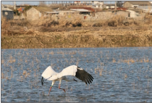
Plate 9. Vitim, Fereydoon Kenar damgah, 5 February 2008.