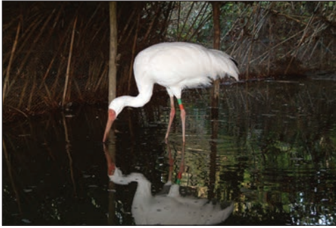
Plate 7. Vitim with colour rings in captivity at Fereydoon Kenar damgah, October 2007. © S Sadeghi Zadegan