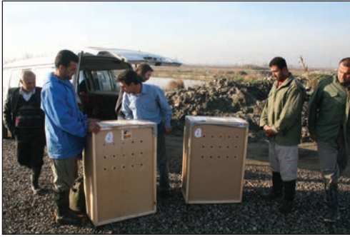
Plate 3. Arrival of Inya and Vitim at Fereydoon Kenar, 26 January 2007.