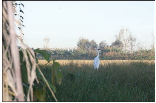
Plate 8. Vitim after his first release at Fereydoon Kenar damgah, 14 November 2007.