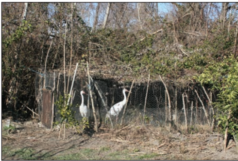
Plate 5. Inya and Vitim in captivity at Fereydoon Kenar damgah the day before Inya's release, 28 January 2007.